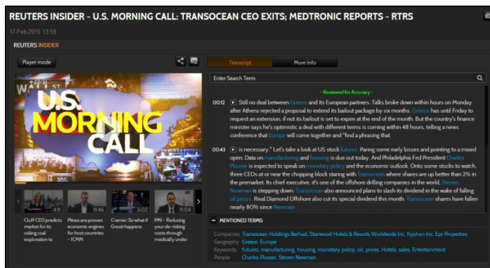
Reuters Insider technology makes video intelligent.