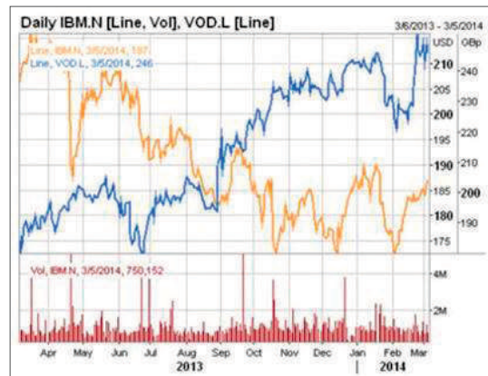
Access to over 200,000 time series instruments. Over 15 different charting analyses and over 45 customizable parameters so charts can be given a unique look and feel.

The Thomson Reuters Knowledge Direct API supports our Digital Solutions offering, which brings together our robust API infrastructure with additional market leading investment tools and capabilities, to deliver leading financial market data, news and analytics to wealth management companies, corporations and fintech developers globally.