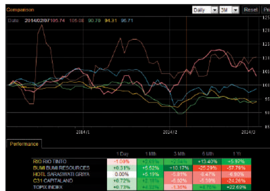
An example of the Chart Analysis available through our partner network.